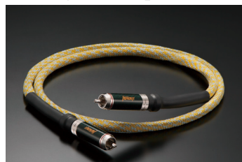
HDG RCA-AES 「Million」

The cables in the audio system are very similar to the human arteries in the body. If there are problems with the arteries, the whole body is affected.