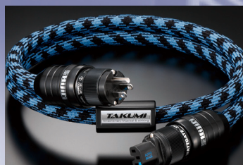
SMT 「匠 TAKUMI」