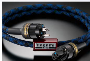
X-DCH 「和 NAGOMI」